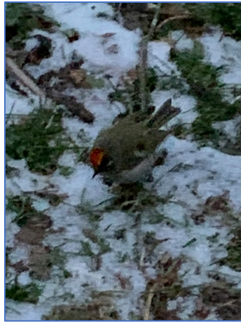
A Ruby-crowned kinglet