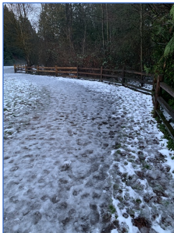
A slushy mess underfoot