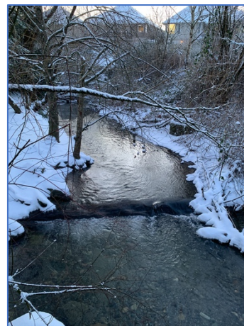
Snow at Bridge One

Notes: It wasn't possible to collect litter from the 13 th to the 17 th due to the snowfall. Scraps of white plastic from the poo-bag dispensers always account for most of the Plastic tally. The greater-than-average total this month shows that under normal circumstance MANY conscientious dog-walkers DO pick up after themselves, but couldn't because of the snow. Of course, all the litter showed up after the snow melted. The melt was not as unpleasant as in past years; it never got cold enough to freeze the slush, so footing remained quite good. The strong winds caused little damage this time.