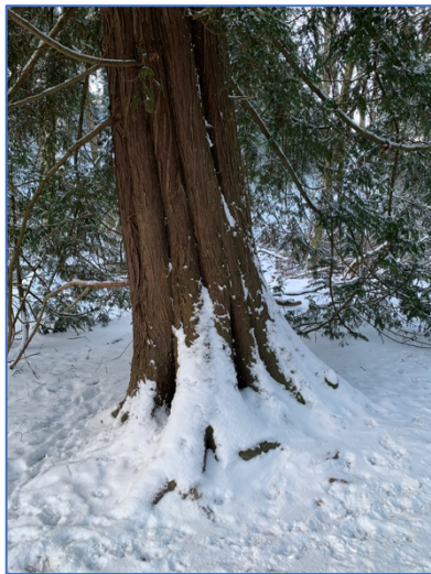
“Cedric” with a skirt of snow